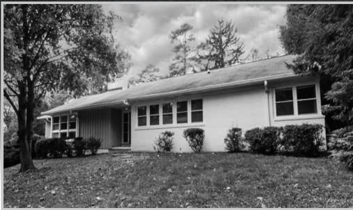
The Julia B. and J. Bertram King House