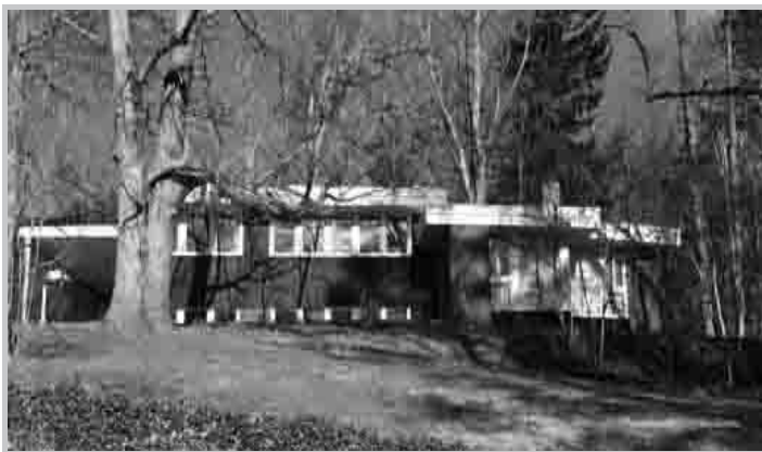
The Ray and Fancella Poston House