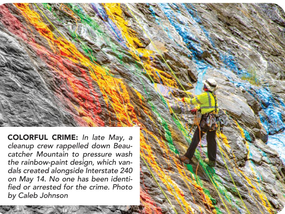
COLORFUL CRIME: In late May, a cleanup crew rappelled down Beaucatcher Mountain to pressure wash the rainbow-paint design, which vandals created alongside Interstate 240 on May 14. No one has been identified or arrested for the crime.